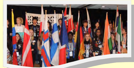
Color Guard at District Convention