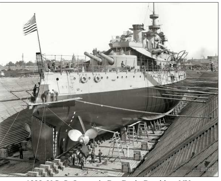
1888, U.S. S. Oregon in Dry Dock, Brooklyn, NY